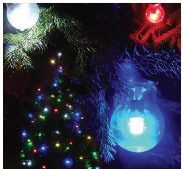
Lumisphere™ Prismatic LED