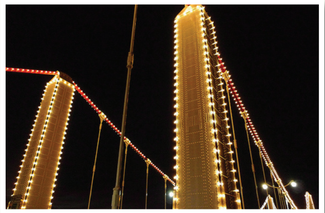
Chelsea Bridge X24 System