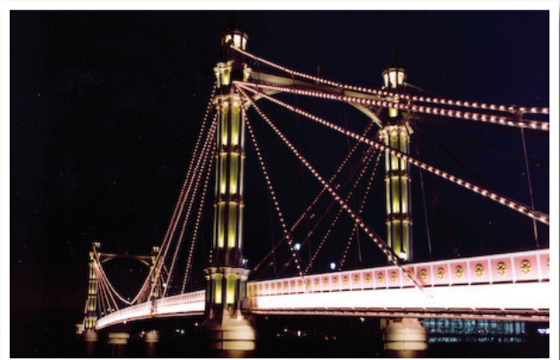
Albert Bridge X24 System