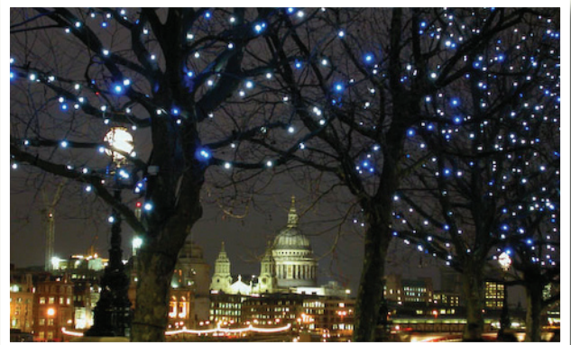
London South Bank Quad LED System